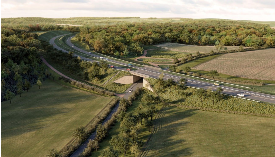
Figure C-1 - Ringland Lane Bridge (Underpass)

Figure C-2 below illustrates the retained woodland, hedgerow planting for the Ringland Lane Bridge (underpass) and how it will link the wider landscape elements.