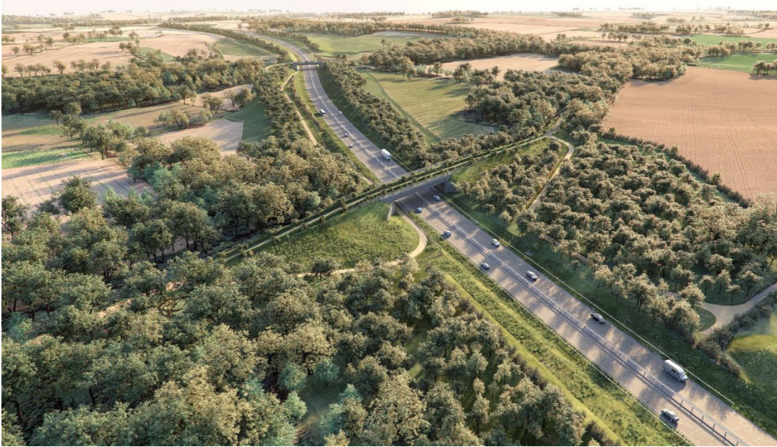
Figure C-1 - The Broadway and Foxburrow Plantation green bridges

Figure C-3 below illustrates the retained woodland, woodland planting and instant hedgerows for the Broadway and Foxburrow Plantation green bridges and how they will link the wider landscape elements.